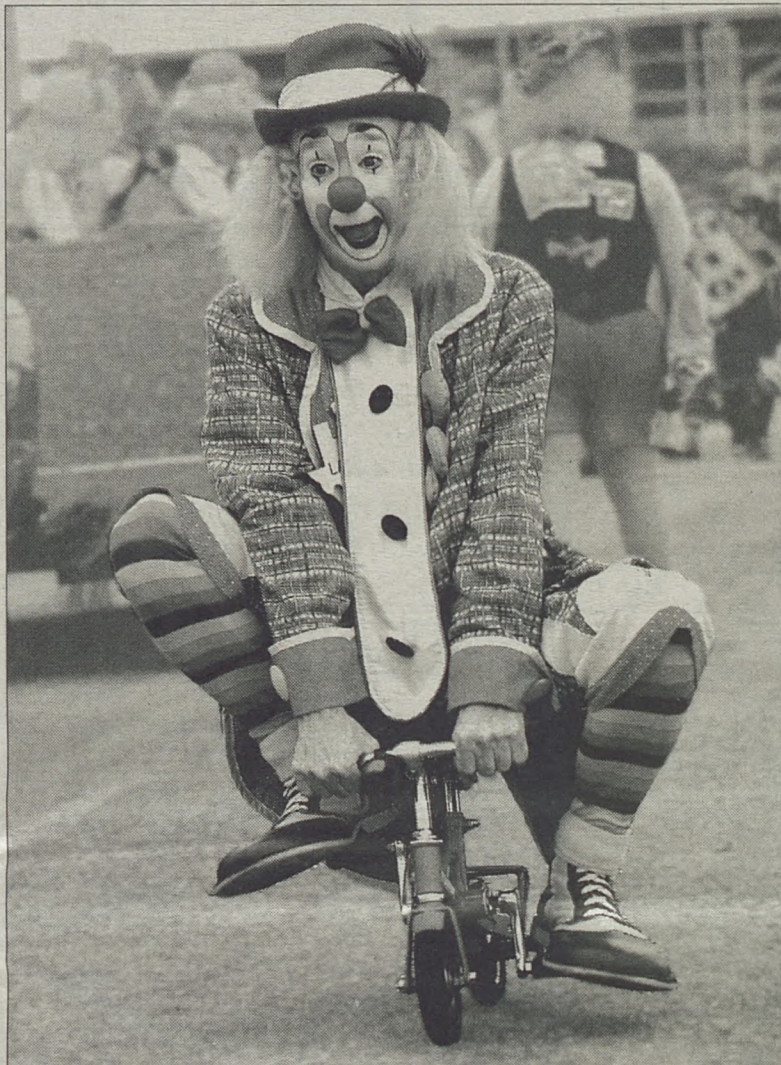
Lanky The Clown will be on hand at the Fair this year to delight fairgoers young and old.

the fairgrounds with their petting zoo and pony rides from Thursday through Sunday. Come enjoy!!